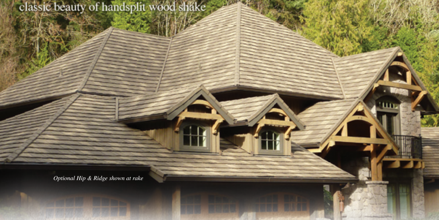
Optional Hip & Ridge shown at rake

As the original stone coated steel roofing system, the DECRA® product line represents a perfect blending of 50 years of research and practical experience. DECRA is manufactured using the finest lightweight aluminum-zinc alloy coated steel, covered with 3M ceramic coated stone granules and sealed with our exclusive polymer coating. Offering the ultimate in performance and engineering design, DECRA Roofing Systems are the most beautiful, durable and trouble-free roofs available today.